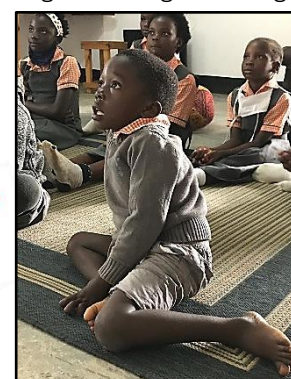
Rapt faces enjoying watching the new Audio Visual room TV